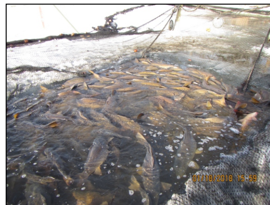
Shown above is a portion of the massive haul of carp harvested on Upper Prior Lake.

According to PLSLWDB Board member Woody Spitzmueller, common carp are one of the most damaging aquatic invasive species due to their wide distribution and severe impacts in lakes and wetlands. Their bottom feeding disrupts shallowly-rooted plants,